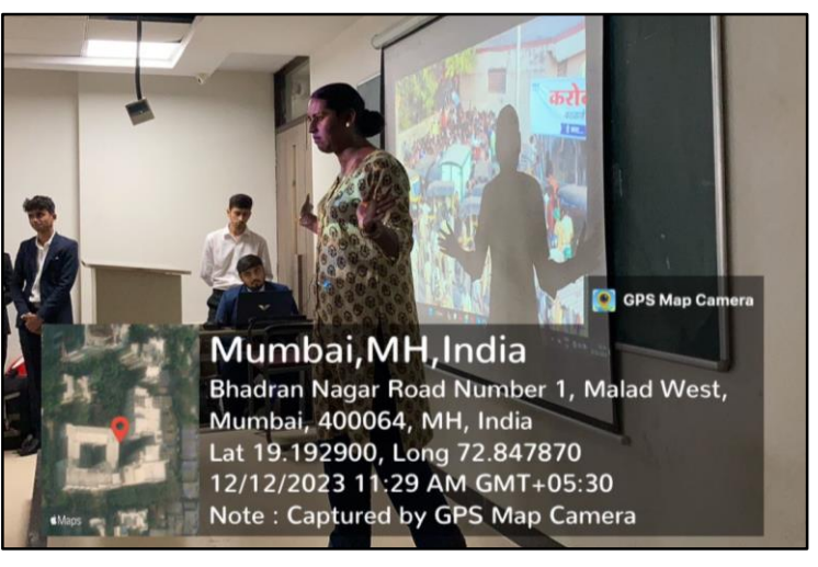
A screening of the shortfilm Zoya was done for the students in attendance. Zoya ma'am also explained the role photojournalism plays in Human Rights.